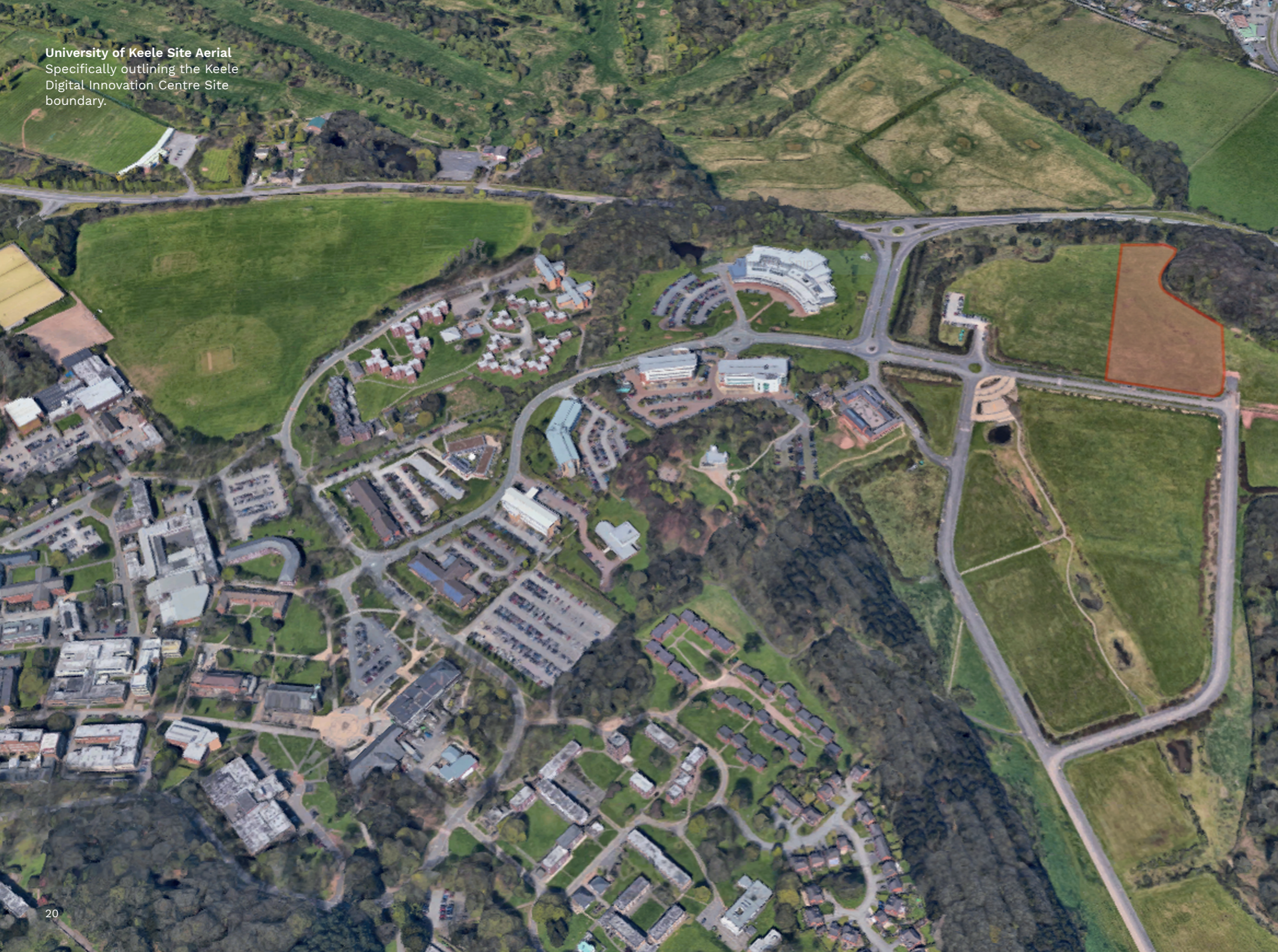
University of Keele Site Aerial Specifically outlining the Keele Digital Innovation Centre Site boundary.