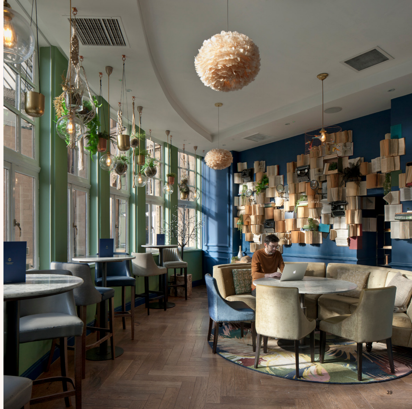
Above: IHG, Park Lane, London Opposite: voco Grand Central, Glasgow

We identify areas where guests can be inspired to relax and work creatively whilst away from home. Our choice of natural fabrics and surface design materials create exactly that vibe.