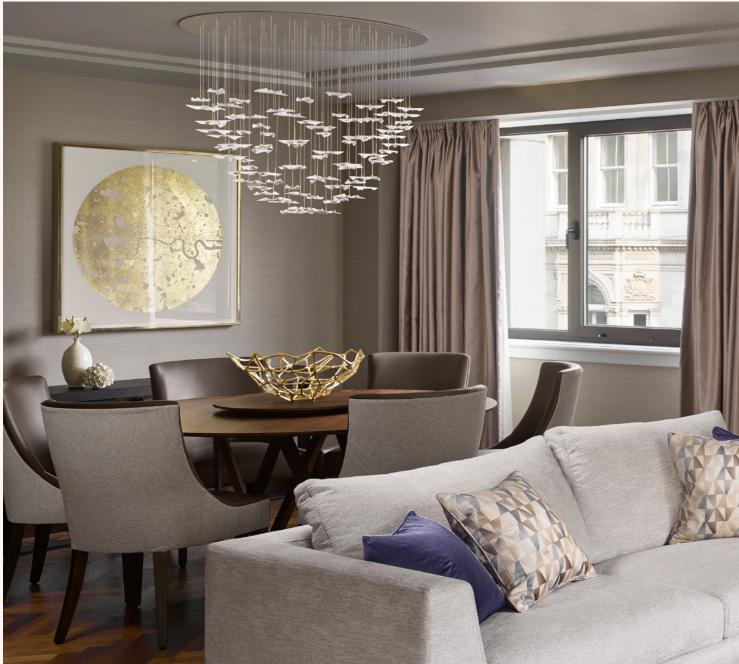
Above: Intercontinental, Park Lane, London Opposite: Marriott Maida Vale, London