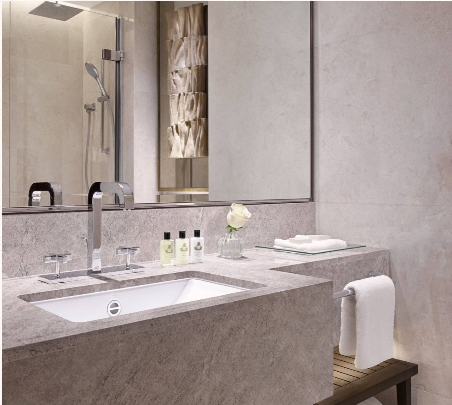
Above: Bathroom at IHG, Park Lane, London Opposite: Oxford Spires Hotel