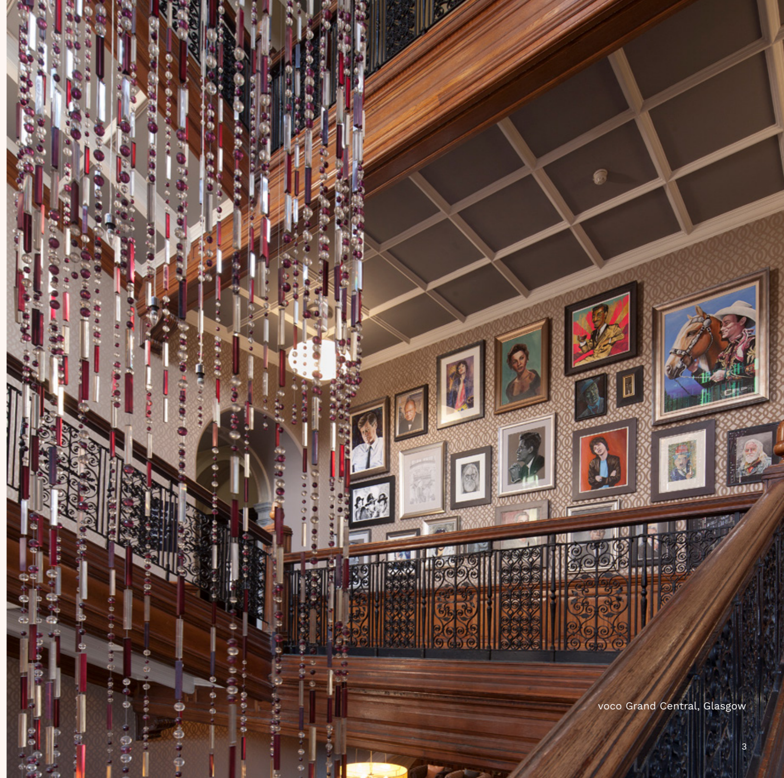
voco Grand Central, Glasgow

Our design team provides a single point of contact to execute projects seamlessly where we create beautiful, functional spaces where guests will want to return.