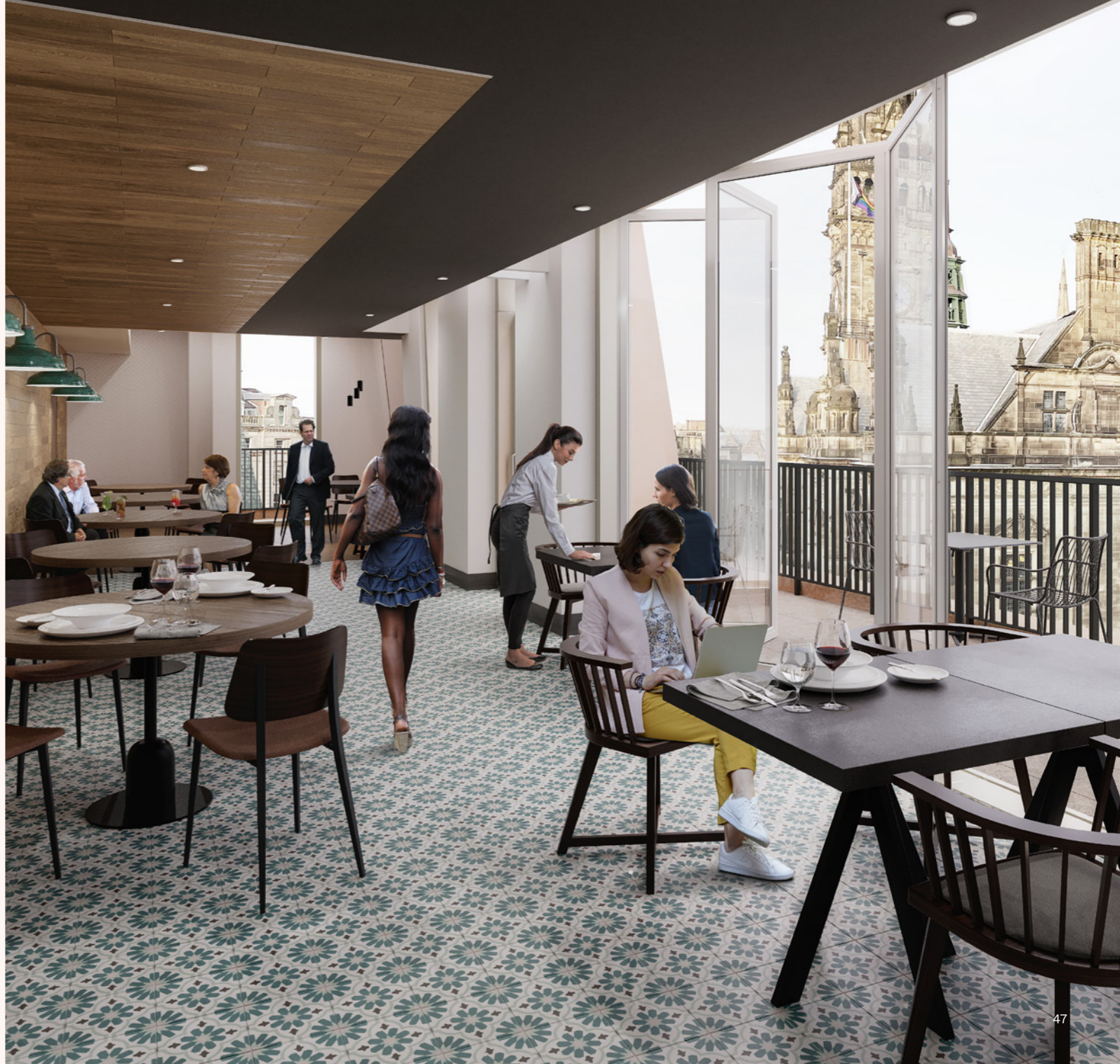
Above: Hotel restaurant Opposite: Terrace with views across the city

A new rooftop terrace and café bar in the heart of Sheffield bring life and modernity to a 100-year-old building in the heart of Sheffield, forming part of the redevelopment of the city centre.