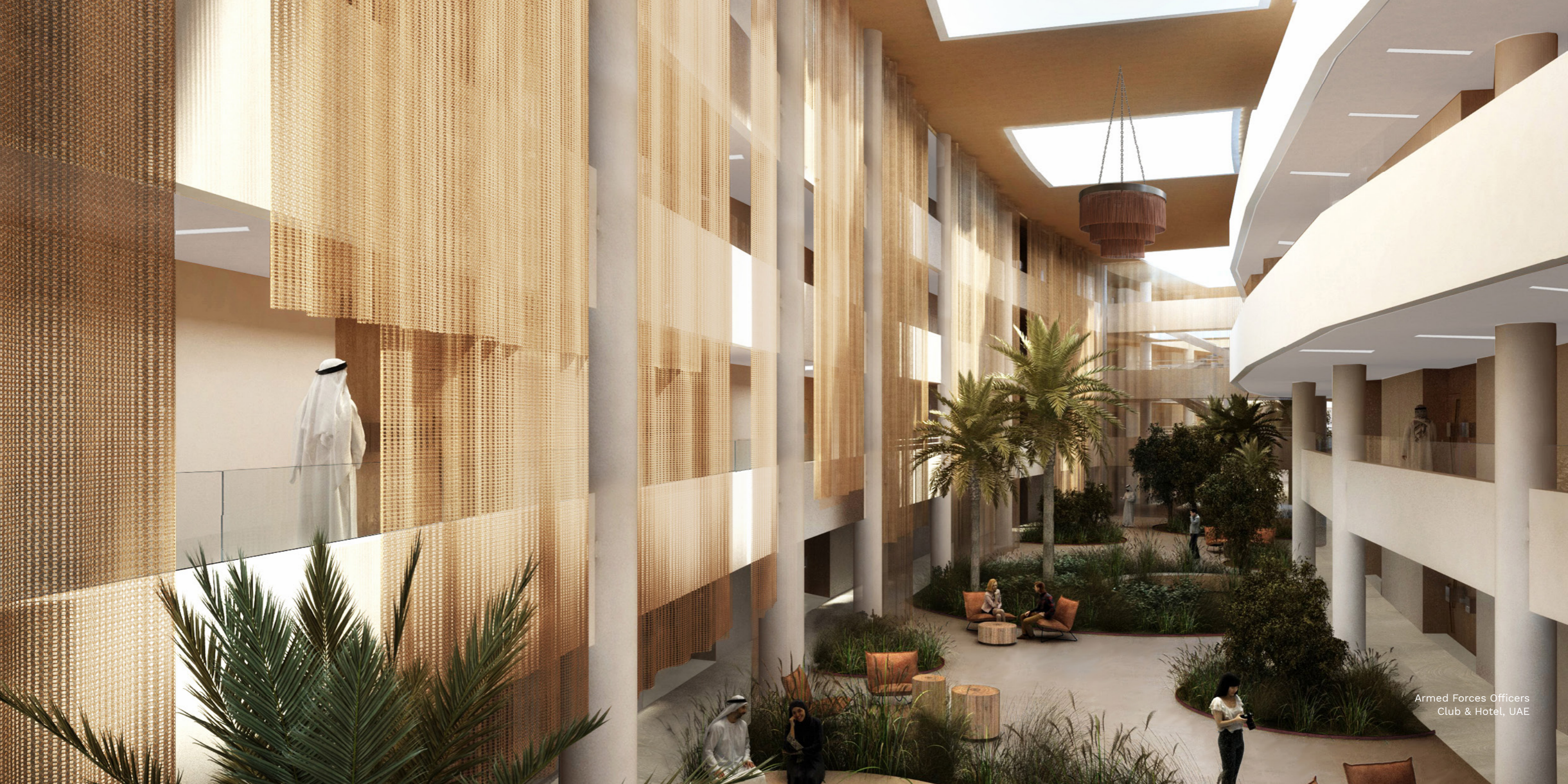
Armed Forces Officers Club & Hotel, UAE