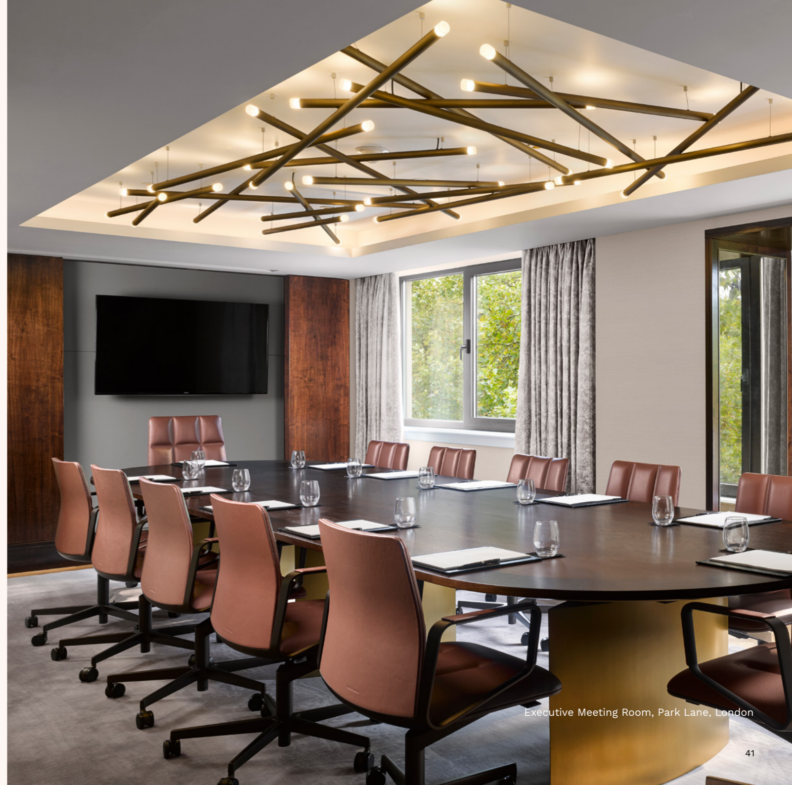
Executive Meeting Room, Park Lane, London

We understand space and its value in creating atmosphere and confidence. We have vast experience in making big spaces feel cosy, and maximising the efficiency and style of small spaces - creating confidence in your clients.