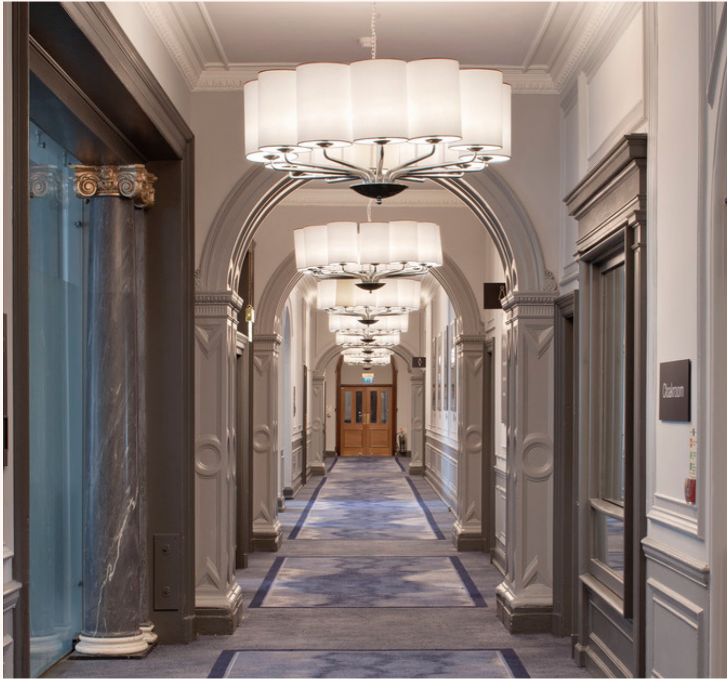
voco Grand Central, Glasgow