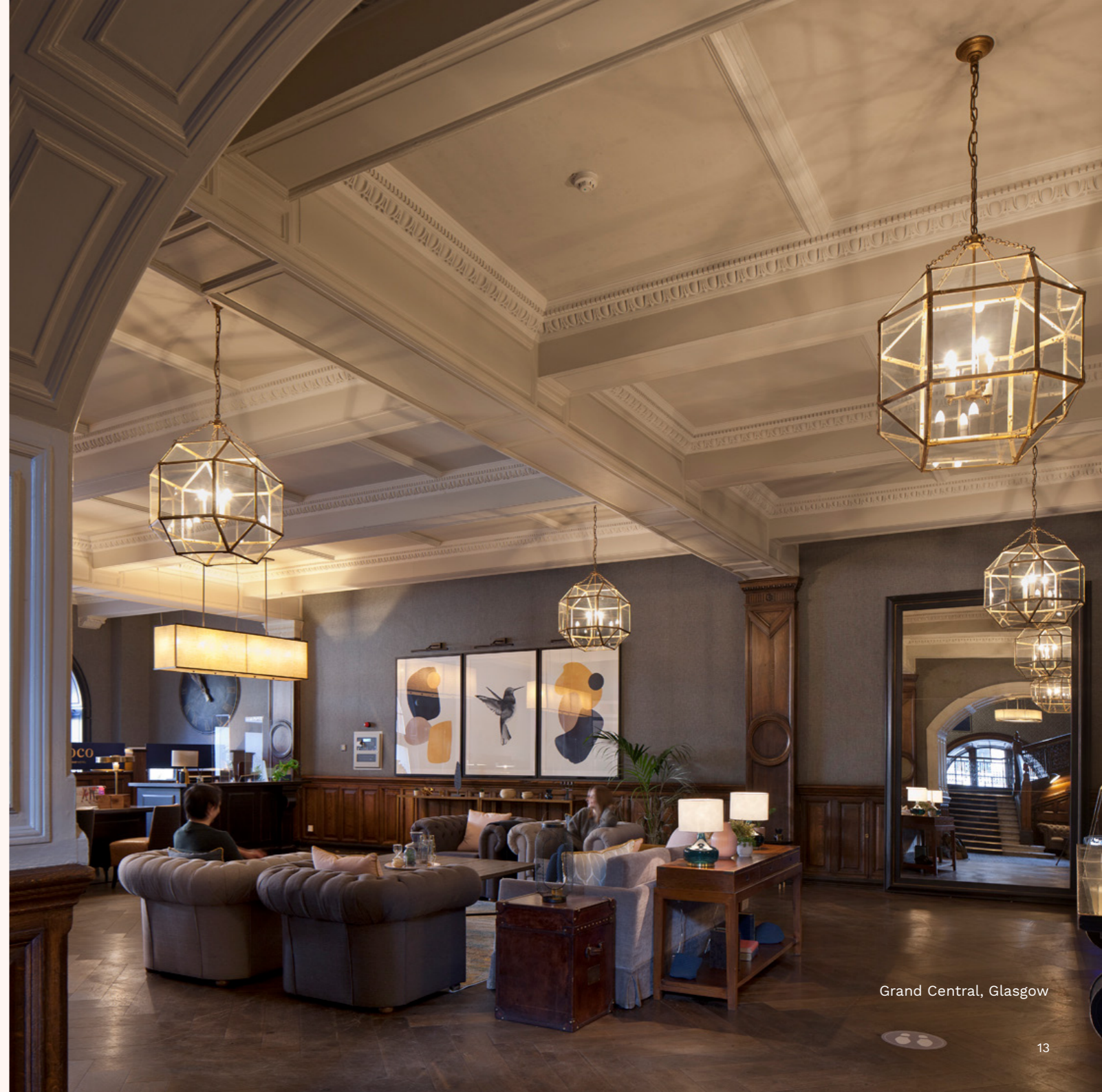
Grand Central, Glasgow

The welcome and comfort on arrival must create a sense of care, service and inspiration, to begin creating a confidence so that all guests feel they are in professional hands.