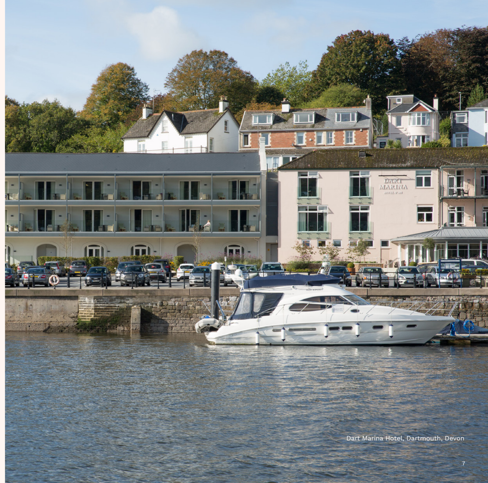
Dart Marina Hotel, Dartmouth, Devon

Boutique, city or by the sea - we always create a very suitable welcome for your guests.