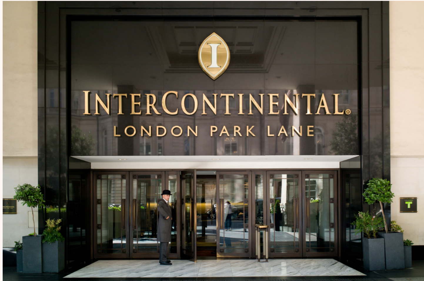
Above: Intercontinental, Park Lane, London Opposite: The Wesley Camden Town Hotel, London