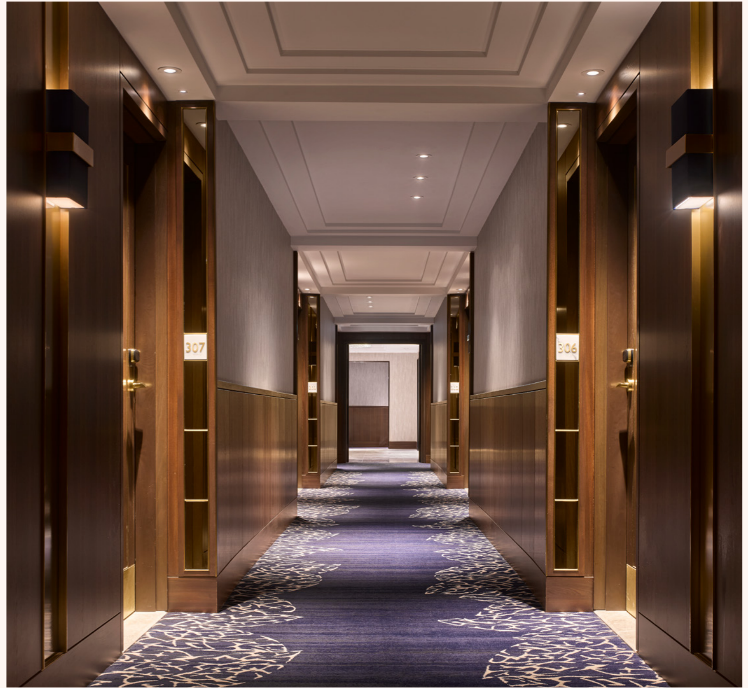
Park Lane, London