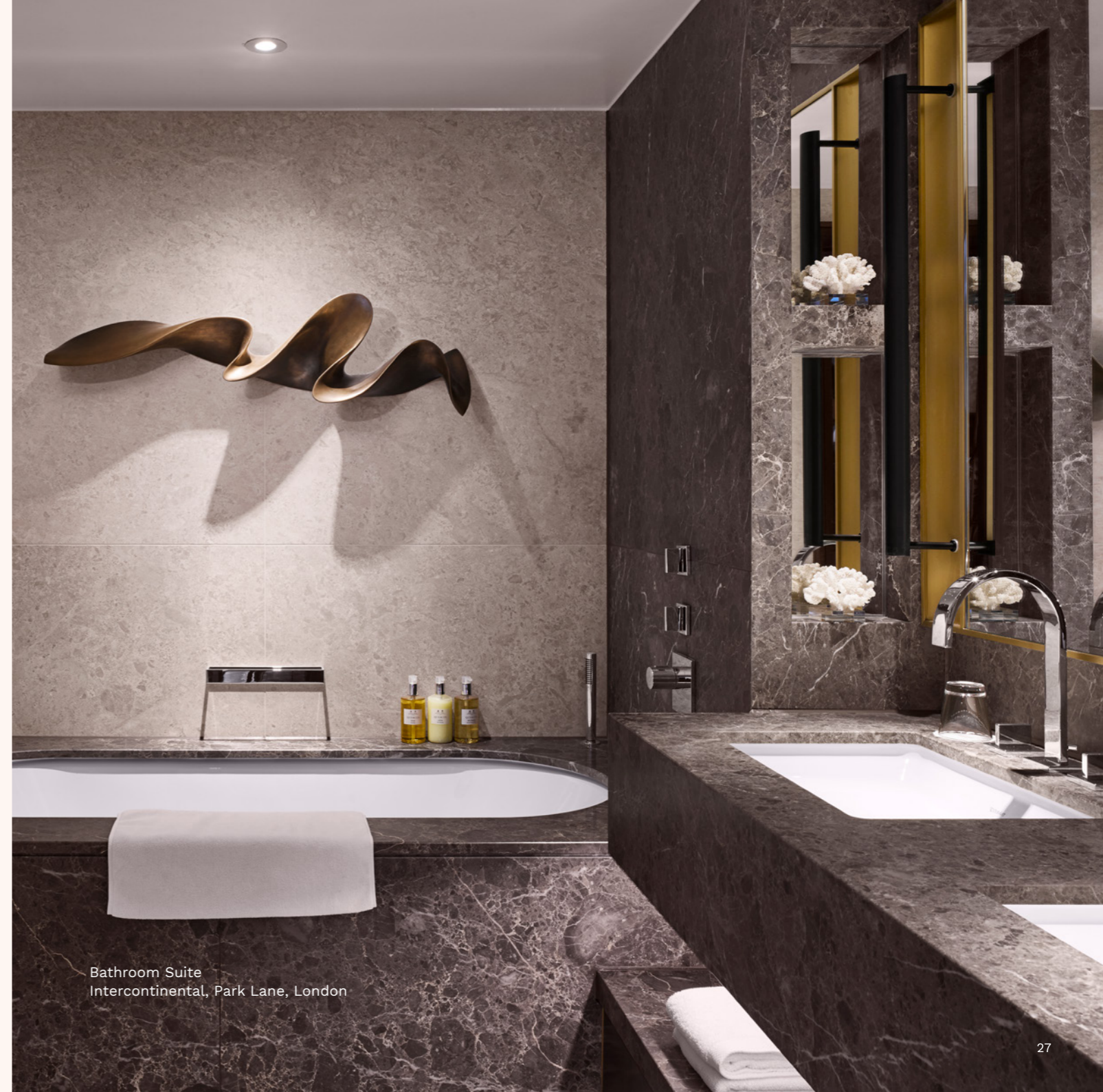
Bathroom Suite Intercontinental, Park Lane, London

Bathrooms with decedent furnishings create a lasting impression.