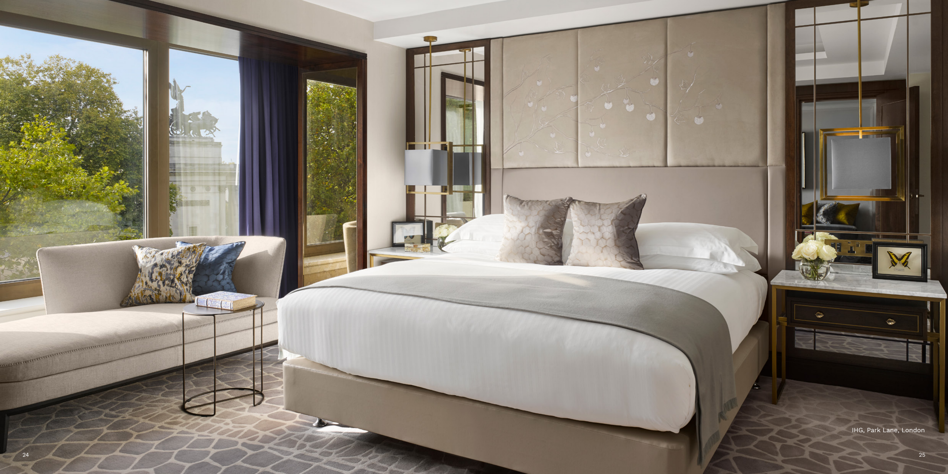
IHG, Park Lane, London